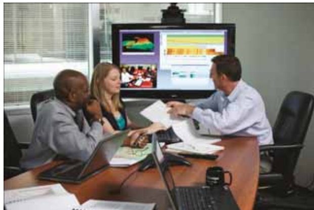
Satellite links and video-conferencing systems made it easier for geographically-separated teams to work together

This centralized architecture is of course very dependent on the quality, speed and reliability of the network, and for mission-critical activities many companies still see a risk factor for remote users either operating on or close to drilling facilities (i.e. away from major urban areas), or for opera-